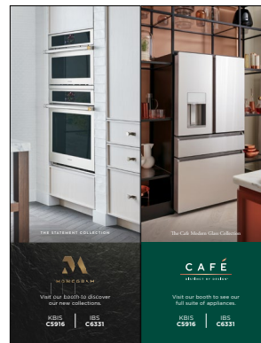
Inside Front Cover and Page 01