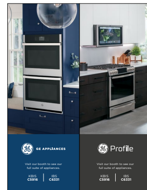
Page 32 Ad and Inside Back Cover