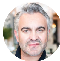
Martyn Lawrence Bullard, Martyn Lawrence Bullard Design